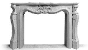
Louis XV Fireplace ▶ click to see larger view